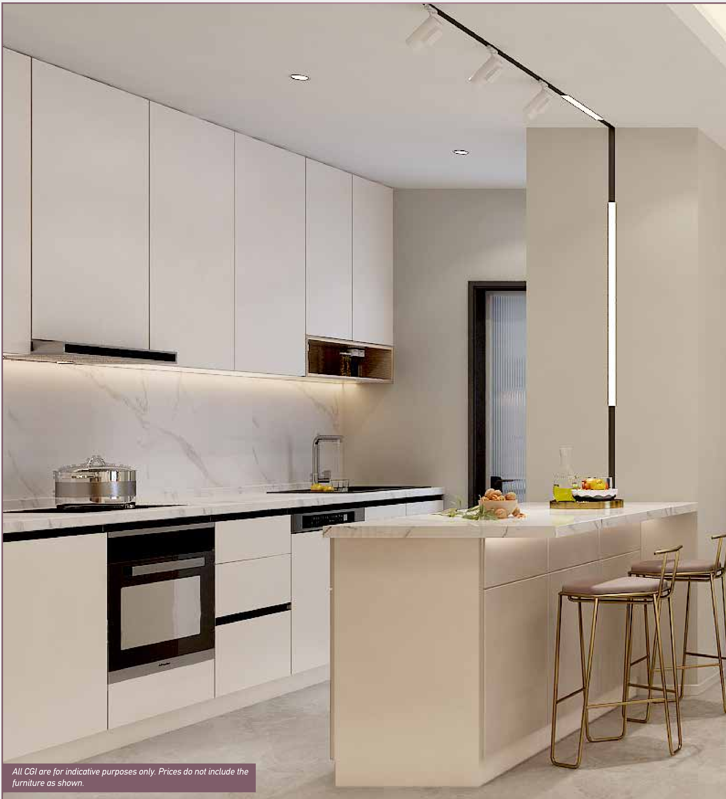
All CGI are for indicative purposes only. Prices do not include the furniture as shown.